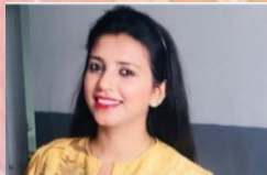
BY AANCHAL GUPTA T.G.T English

Don't you marvel at the unique lunacy of a language in which your house can burn up as it burns down, in which you fill in a form by filling it out and in which your alarm clock goes off by going on! English was not invented by computers. It is the creativity of the human race (which is not a race at all). That is why, when stars are out they are visible, but when lights are out they are invisible. And why, when I wind up my watch I start it, but when I wind this essay I end it.